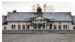
Pay tribute to those whose lives were lost at Dachau Concentration Camp Memorial Site