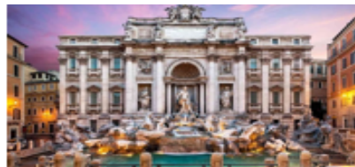
Visit Trevi Fountain in Rome