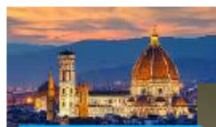
Art and Culture in Florence

TOTAL COST: $5500 (approx. – Final Cost TBD)