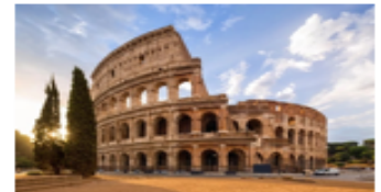
Visit the Colosseum & Roman Forum

A feasible schedule of payment increments will be made available to those interested in attending this once in a lifetime opportunity! If interested in participating in the trip offered by Thornlea – Germany, Switzerland, and Italy please complete the Google Form below.