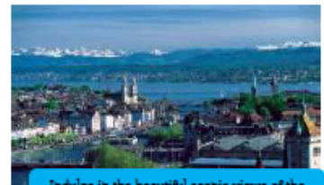
Indulge in the beautiful scenic views of the Swiss Alps seen from Lake Zurich!

Students will be departing from Pearson International Airport in the evening of Friday April 25 returning Sunday May 5. Only five (5) school days will be missed.